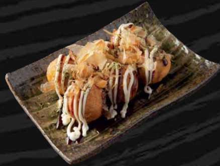
Fried Takoyaki 9.2 6 pieces