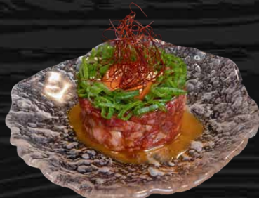
★ Wagyu Tartare 22.8