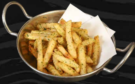
• Salted French Fries 6.6