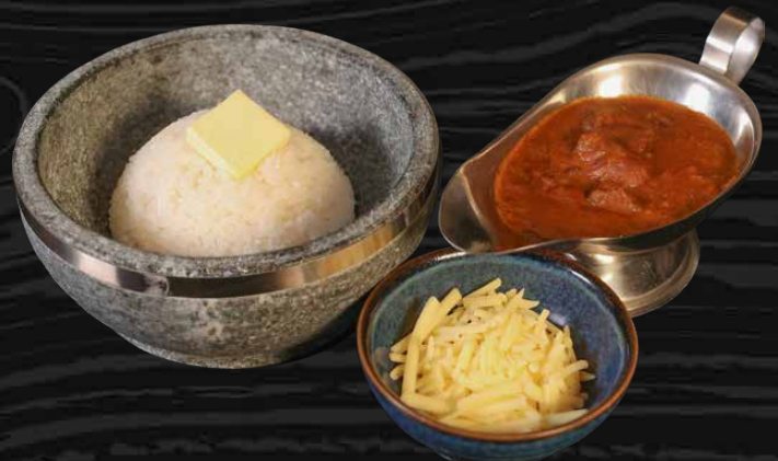
Hot Stone Bowl Cheese Beef Curry