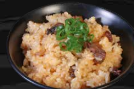
Garlic Beef Rice