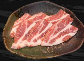
Iberico Pork Neck