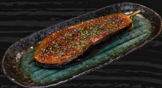
★ • Nasu Dengaku 9.8 Fried aubergine with sweet miso