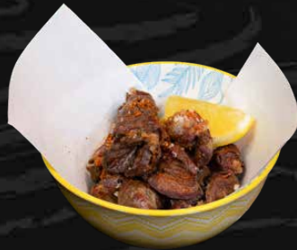
★ Fried Chicken Hearts 6.8 Tossed in sea salt and shichi-mi chilli flakes