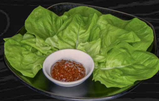
Sanchu Lettuce Wrap