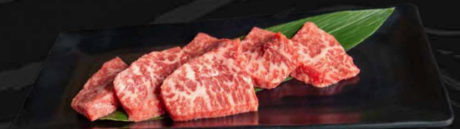
Premium Oyster Blade