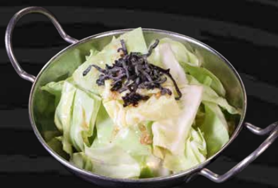
● Yamitsuki Shio Cabbage 6.8 Izakaya style "addictive" salted cabbage