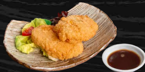
• Vegetable Croquette 9.8 With katsu sauce 2 pieces