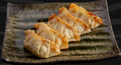
Fried Chicken Gyoza 9.2 5 pieces