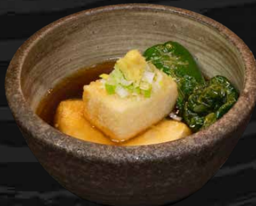
Agedashi Tofu 9.8 Fried tofu with soy sauce broth