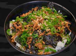
HACHI House Rice