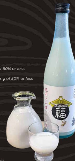
Kawatsuru Nigori Sake