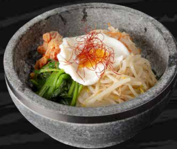
Hot Stone Bowl Bibimbap