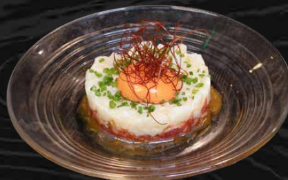
Wagyu Scallop Tartare 34.8