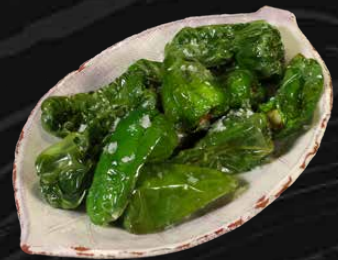
• Fried Padrón Peppers 8.5