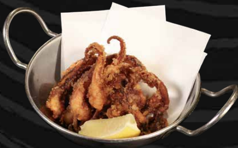
★ Ika Geso Karaage 11.9 Fried squid tentacles