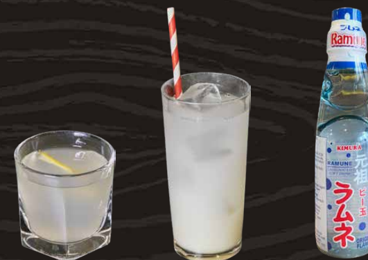
Hot Yuzu Tea