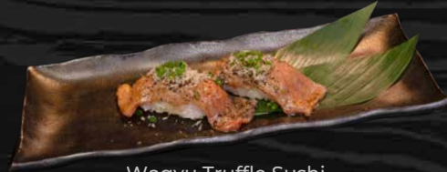
Wagyu Truffle Sushi