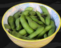
● Salted Edamame 4.9