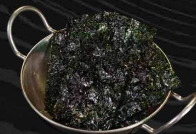
● Korean Seaweed 3.3