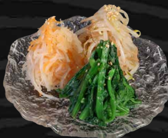
★ ● Assorted Namul 9.8

Korean spicy pickled Chinese cabbage, contains traces of prawn