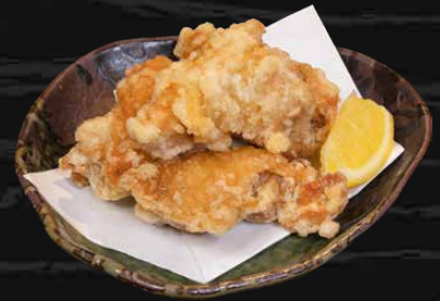
Chicken Karaage 8.5 Japanese style fried chicken 4 pieces