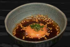
Golden Yolk BBQ Sauce