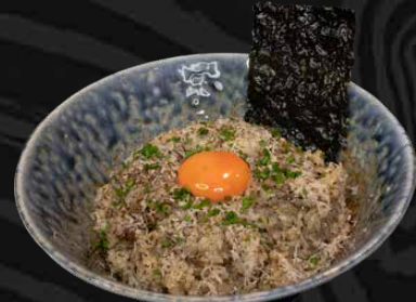
Truffle Garlic Beef Rice